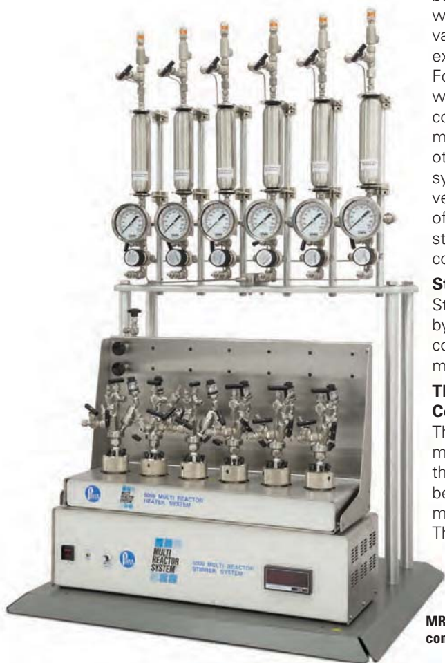
MRS with individually controlled Gas Burettes.

The controller provides Ramp & Soak programming for individual reaction vessels, digital inputs and outputs for interlocks, alarms or other safety features, and additional analog and digital inputs and outputs to control flow meters or other accessories which might be added at some future date. The user's control station is a PC running any current Windows operating system. A simplified graphical user interface has been designed for the control and monitoring of the Series 5000 Multiple Reaction System. The PC is used strictly as the user interface and data logging module. All control actions are generated in the 4871 Process Controller (not the PC).